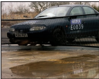
The Berry Brisafe system undergoing tests at MIRA.